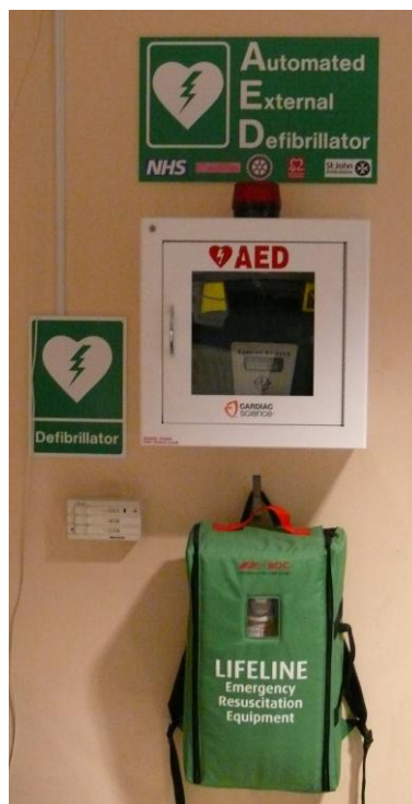
AED and Oxygen Kit, located behind the Reception Desk of the Sports Centre at Cleeve School